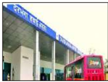
Present Time Departure Gate : 8.5 Kms