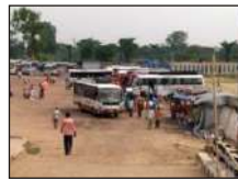
Bus Stand 8.5 Kms