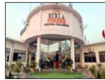
Birla Open Mind International School 1.5 Kms