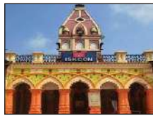
Isckon Temple 12 Kms