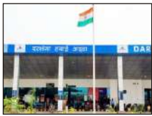
Airport New Departure Gate : 3 Kms