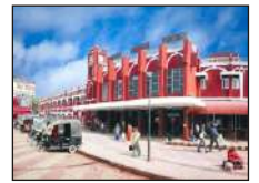
Railways Station 10 Kms